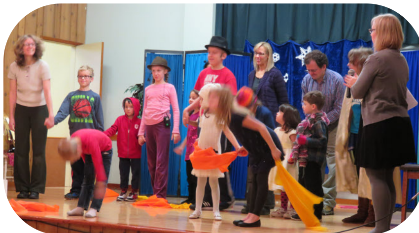
Gratitude brings back the Sun