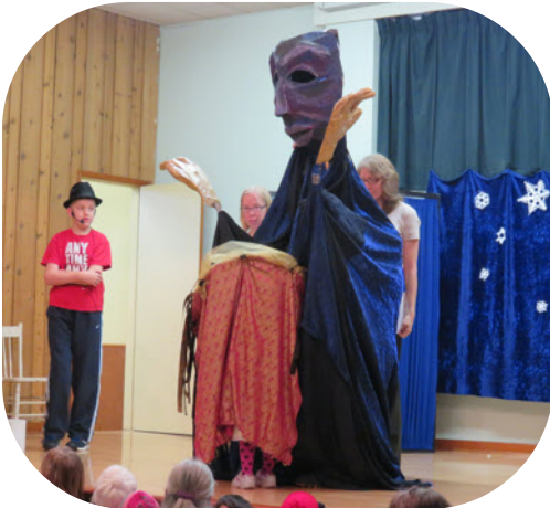
Mother Darkness swallows the Sun