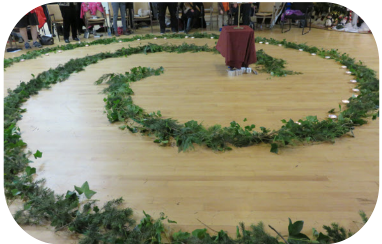
The spiral walkway where the gratitude candles were collected. Folks came to the centre, and each lit a candle in gratitude for something in their lives, and left the candle on the spiral on their way out.