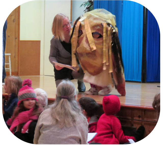
Amber introduces the Sun