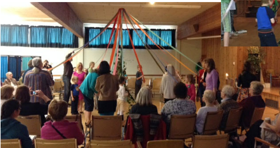
Views of the Maypole, at the service on May 3