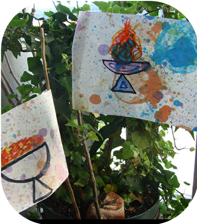
Flags from the children's program

This was my sixth year at Camp Sasamat, and I appreciate the campers who come back each year, providing us with the opportunity to deepen our knowledge of—and our trust in—each other. Equally important, is the opportunity to meet new campers and create new connections. It is a gift to partake in this creative community.